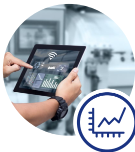
Machine monitoring (temperature, pressure and humidity sensors)